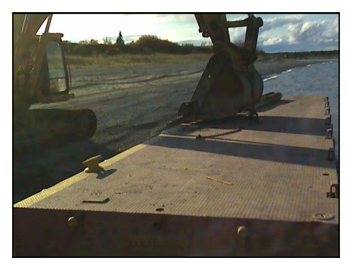
Taking the barge apart for the season.