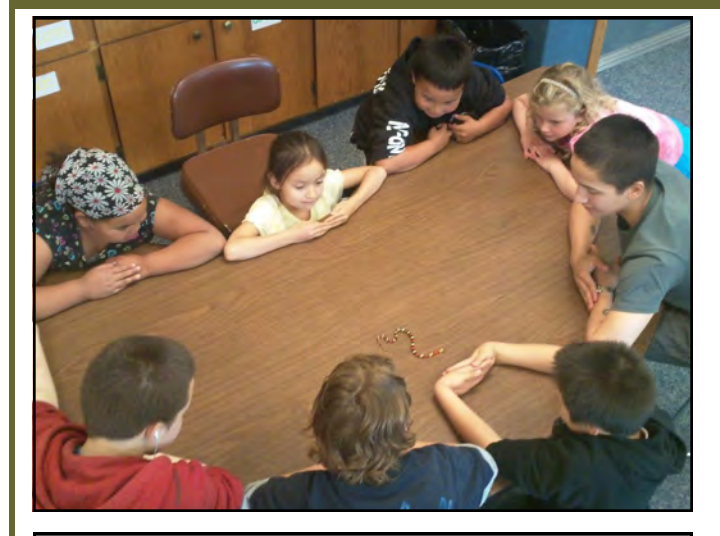
Igiugig Students enjoying their new class pet; a milk snake named Sirius.