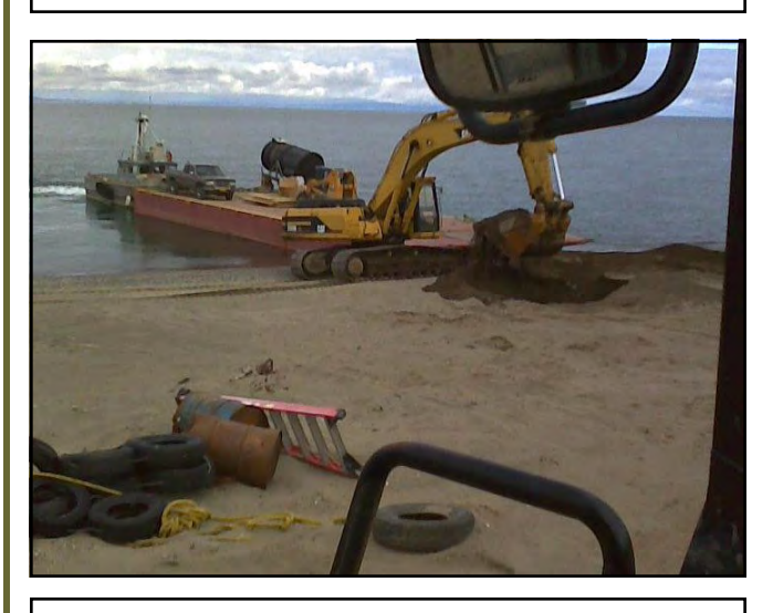
Last barge load...look at our new burner!