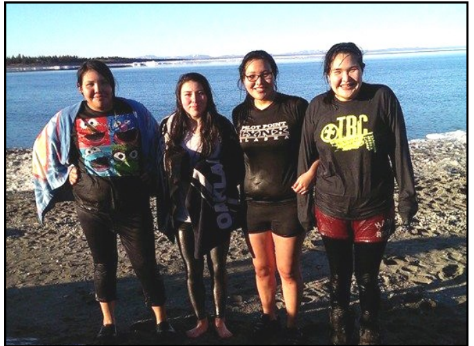
That's cute, you went swimming in June! Try March :D