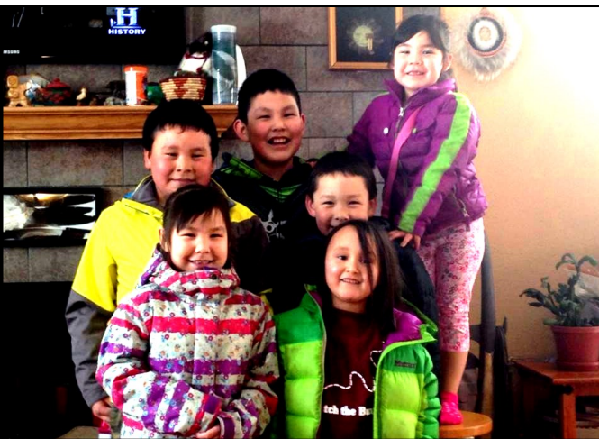
The Wassillie Cousins Reunited in Anchorage