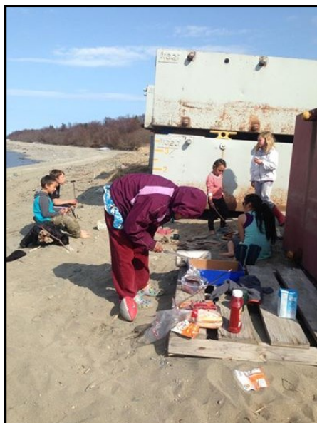
Picnic at the beach enjoying the sunshine.