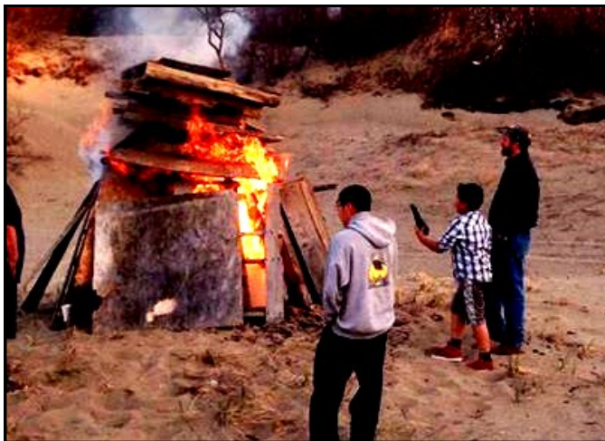
Lighting the bonfire Graduate Celebration