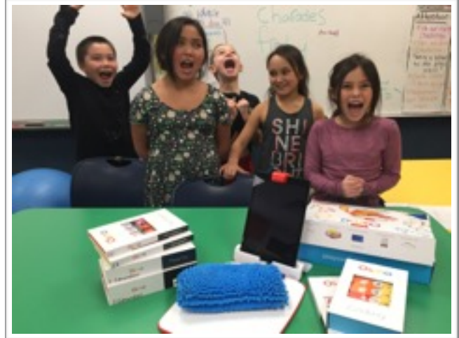
Primaries receiving their Osmo iPad Apps for primary math.