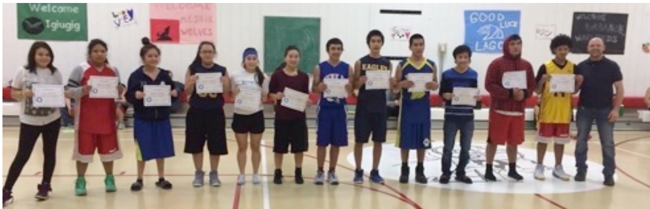
The students who made All-Tourney